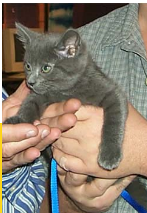
Spirit the kitten