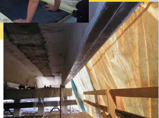
Eight weeks after the workshop, Perm engineers had the CFRP laminate in place on the Tiskovka Bridge.