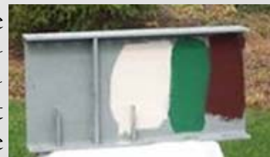
The paint, supplied by Sherwin Williams, will be green, beige and chestnut brown.

A contract was awarded in June to Atlantic Painting Company, Inc. to paint the bridge, which connects downtown Louisville and Jeffersonville, Indiana. Atlantic, of Oak Lawn, Illinois, began working on site in August and the entire project will be completed by July 31, 2006. Work will involve the complete removal of lead paint through abrasive blasting and repainting of the entire bridge using an environmentally ap-